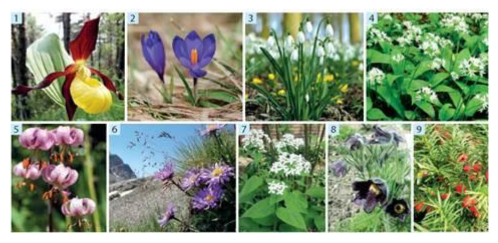
Fig. 1. Plants of the Red Book of Ukraine: