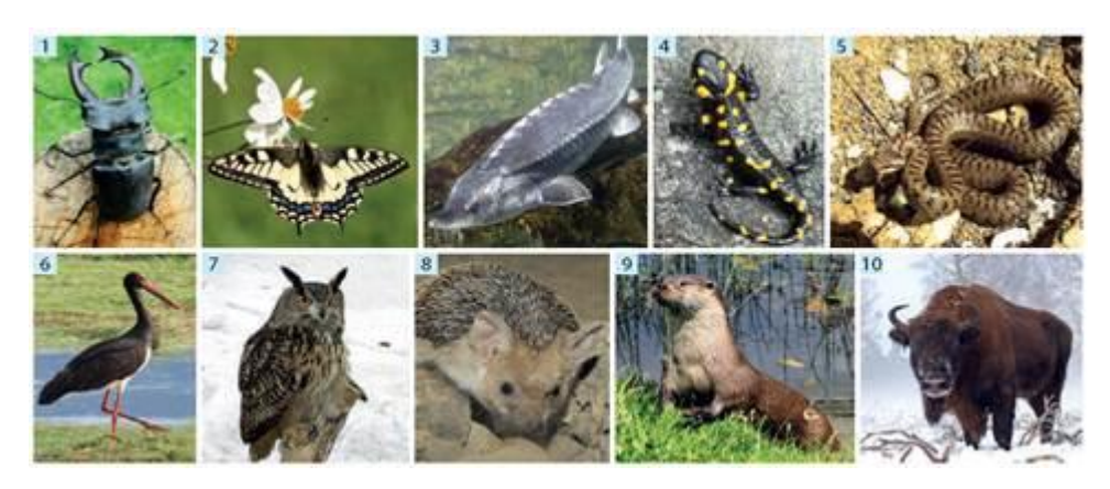
Fig. 2. Animals of the Red Book of Ukraine: