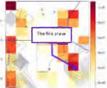
Figure 3. Spatial distribution after Laplacian